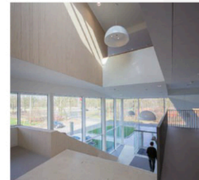
Bekkering Adams architects make innovative and sustainable buildings, interiors and public spaces that are customized for the environment. OPPOSITE PAGE: Ensemble Bloemershof. TOP LEFT: Esprit Headquarter Benelux. BOTTOM LEFT: Fire Station Doetinchem. RIGHT: Private House.

eyecatcher of the building, flooded with daylight and with a view to the patio on the top floor."